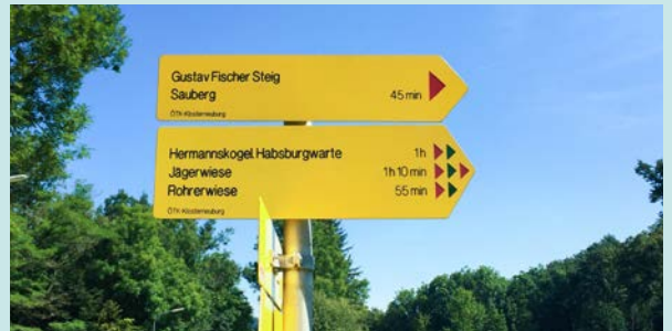
Hiking trail signs