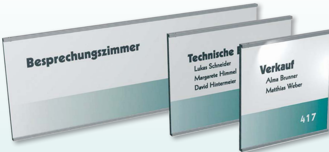
Combiflex Plana doorsigns

Flat door signs (8 mm depth), made of anodised aluminium sections and glare-free acrylic glass covers. Fitted with slide-in paper labels.