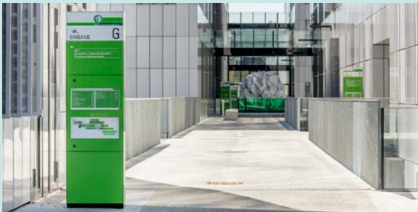
Indoor and outdoor signage systems