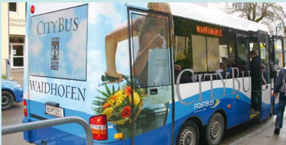
Advertising systems - vehicle signage, exhibition advertising, adhesive film and signs