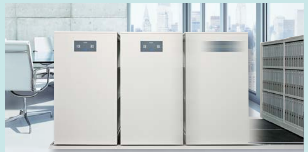
Mobile and stationary shelving systems

For more information on our product range please visit www.forster.at