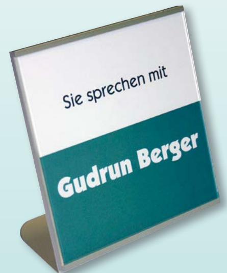
Combiflex Plana desktop sign